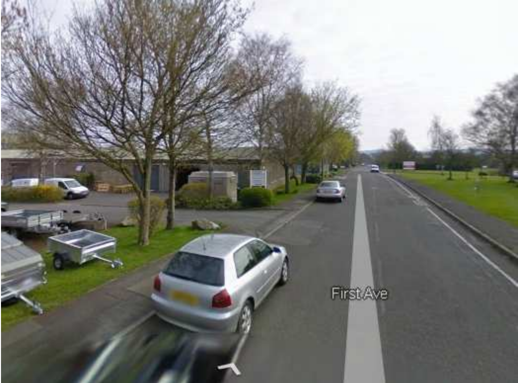
View along First Avenue towards Fosseway – Integrity Print is the large complex to the left of the picture